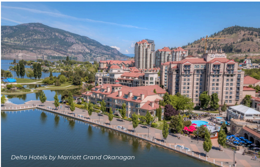
Delta Hotels by Marriott Grand Okanagan