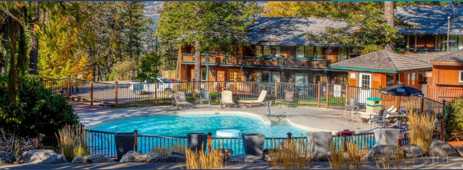
Fairmont Hot Springs Resort