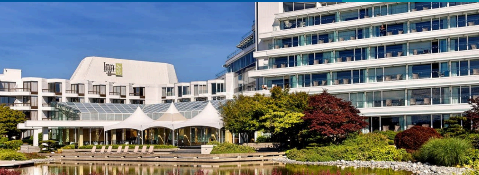
Inn at Laurel Point, Victoria