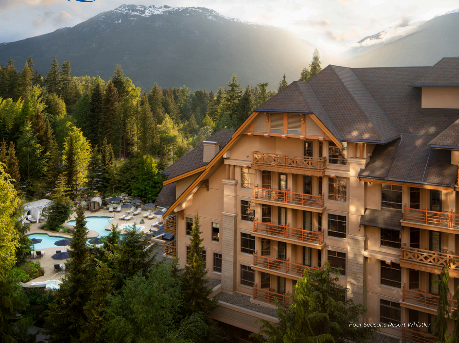
Four Seasons Resort Whistler